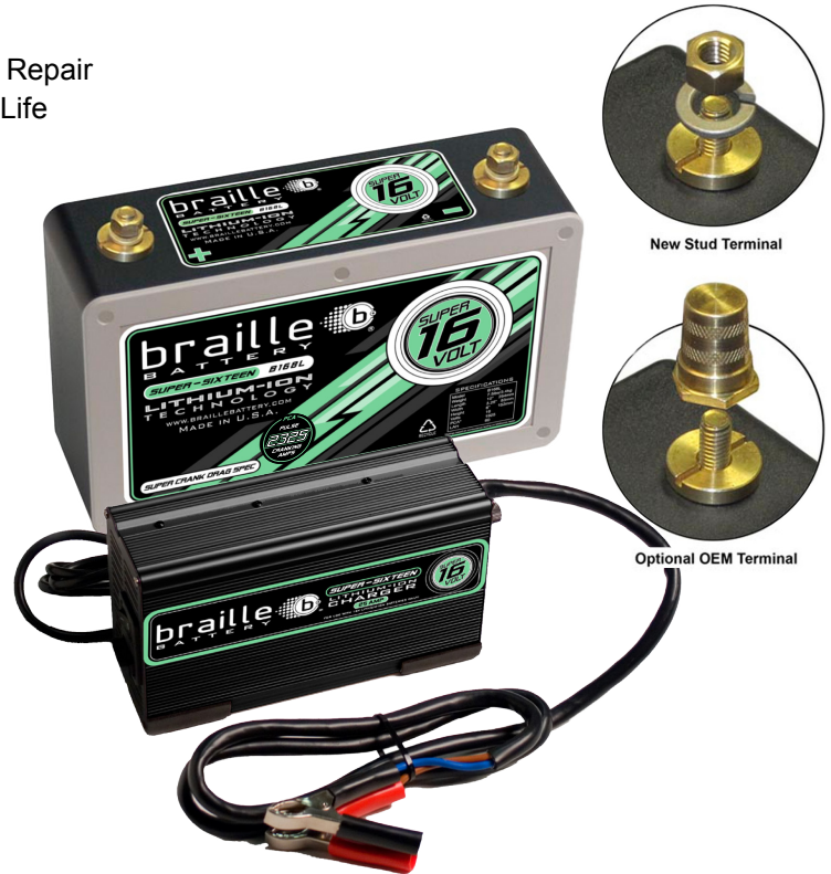
Combo includes 25A 16V lithium charger

Warranty: 1 Year Free repair/replacement. See warranty terms and conditions.